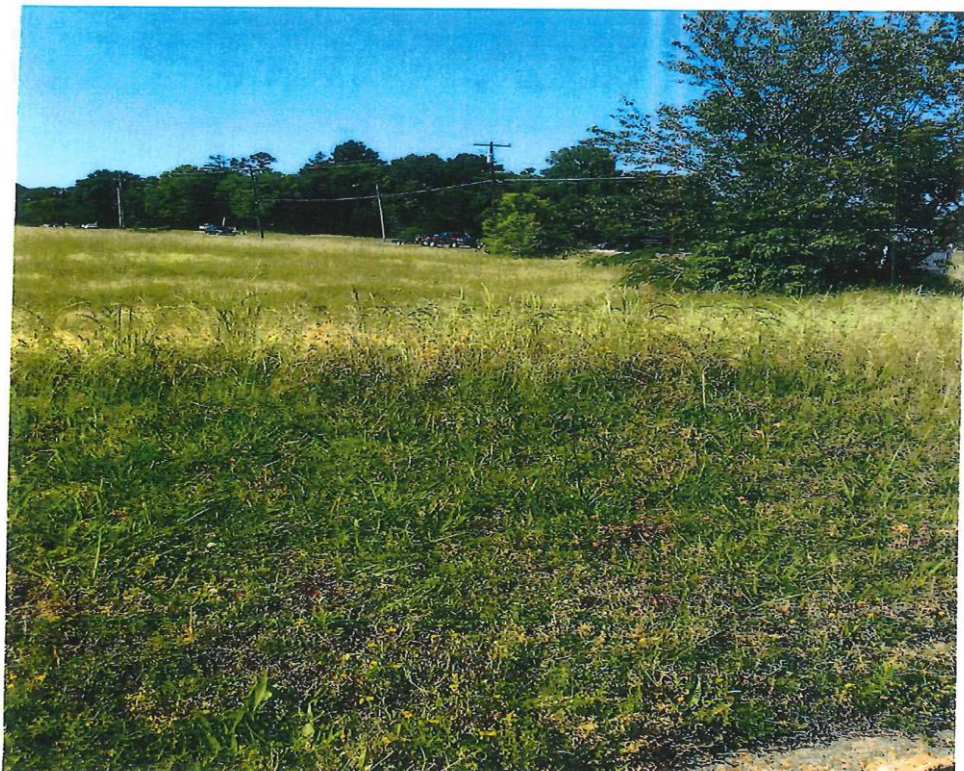
updated photo - June 3, 2016