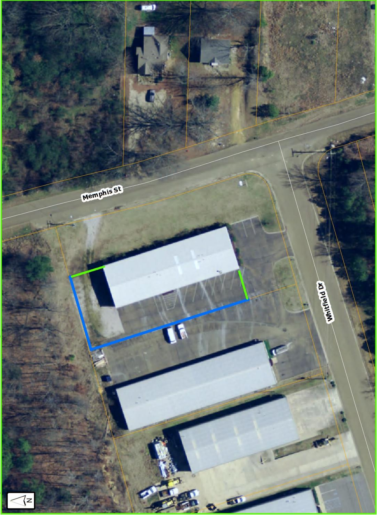
City of Hernando: Aerial Map